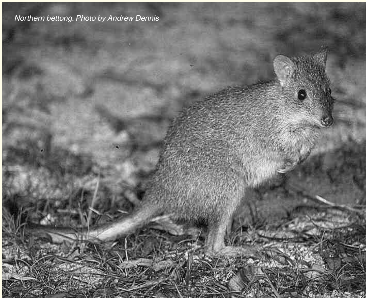
Northern bettong.